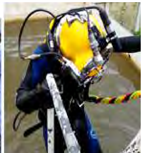
Leaving the surface for a dive

As part of the country's bilateral cooperation and