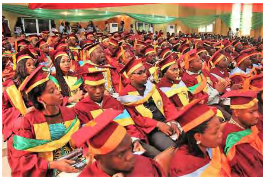
A Cross section of graduating students

In his words, "The Federal Government has doubled her efforts in providing effective policies that will drive gas utilization and commercialization. We have decided to invest in the Seven Critical Gas Development Projects in Nigeria. These projects will deliver about 3.4 billion standard cubic feet of gas