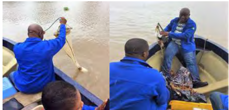
Environmental Impact Assessment of Polaku Pipemill for NCDMB, Yenagoa Bayelsa State

ND levels by the National Board for Technical Education (NBTE); the Institute's Petroleum Analysis Laboratory (PAL) carried out Environmental Impact Assessment (EIA) of the POLAKU pipe mill in Bayelsa State for the Nigerian Content Development and Monitoring Board (NCDMB).