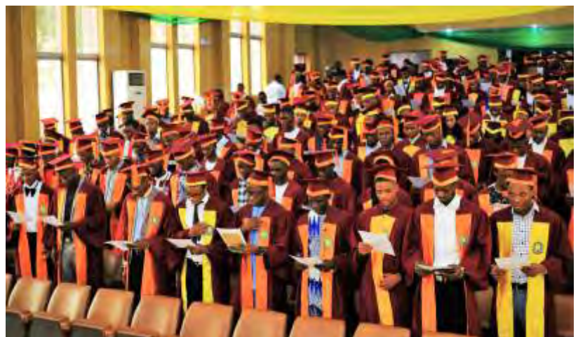
A cross section of matriculating students taking Matriculation Oath

He advised the students to abide by the Institute's rules and regulations as embedded in the students' handbook, warning that infractions would attract severe sanctions. He listed some of these offences as examination misconduct, certificate forgery, stealing, physical and sexual assault, cultism as well as drug peddling and smoking of Indian hemp on campus. ■