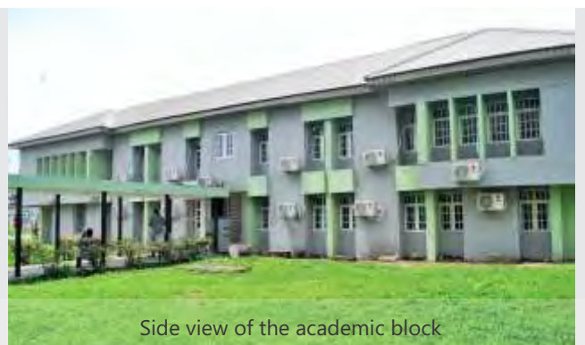
Side view of the academic block