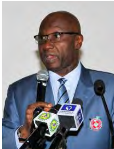
Mr. Boss Mustapha Secretary to the Government of the Federation (SGF)