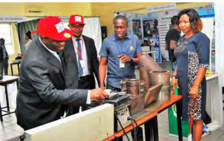
PCE, Prof. Iyuke inspecting one of the Students project from Welding Department at PTI Exhibition stand.

Iyuke who advocated for proper equipment in