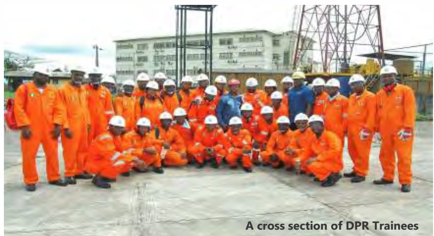
A cross section of DPR Trainees

Resources (DPR) for training of its newly recruited employees, the Office of the Presidential Adviser on Niger Delta and Coordinator of the Amnesty Programme on training of some PTI staff in the United Kingdom; Association of Esan Professionals on training of