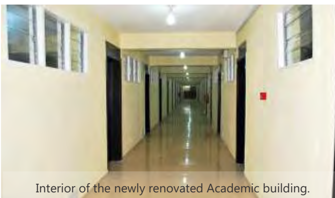
Interior of the newly renovated Academic building.