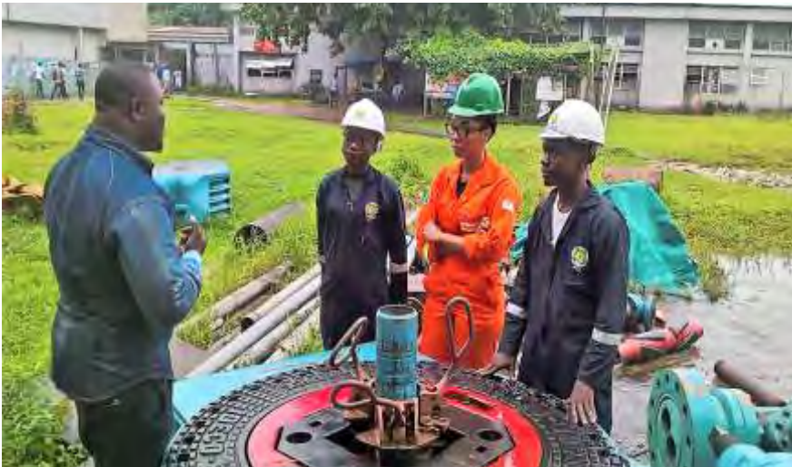
Sinopec and Multinational Trainees in Partnership with NCDMB

Internationally Certified Professional Welders.