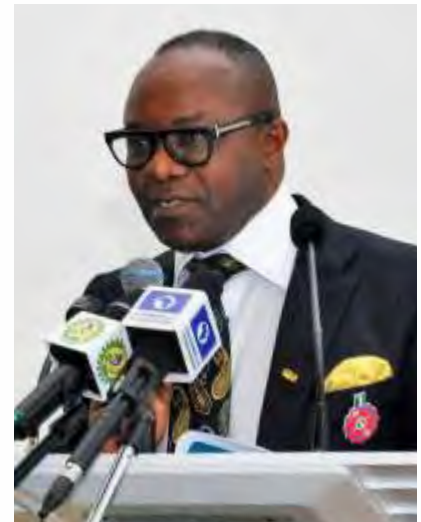
Dr. Emmanuel Ibe Kachikwu then Minister of State, Petroleum Resources