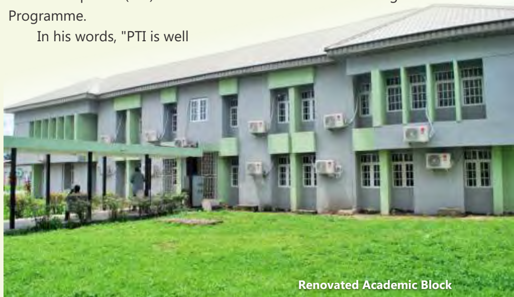
Renovated Academic Block