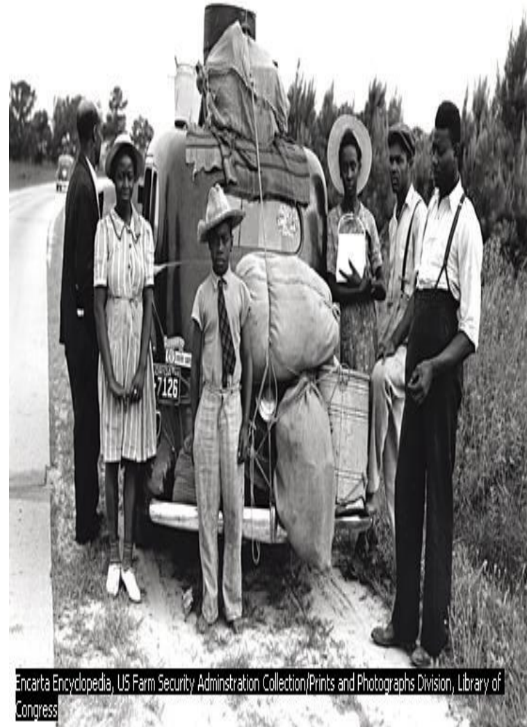
Encarta Encyclopedia, US Farm Security Administration Collection/Prints and Photographs Division, Library of Congress